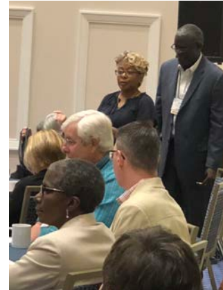
It was a well-attended meeting!

Members’ publications, awards & honors, and promotions and tenure!