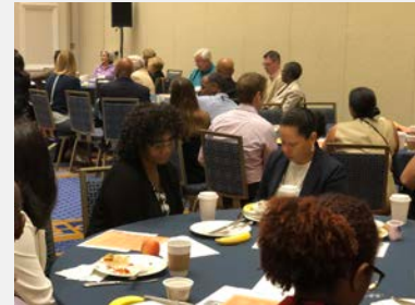
Attendees at the Section Breakfast and Business Meeting.